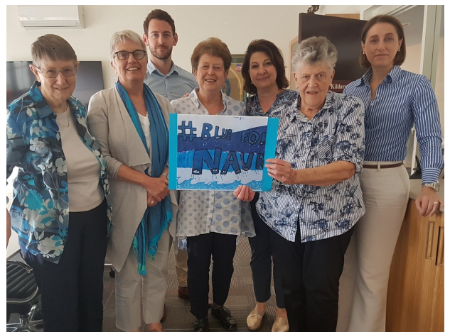
We gathered in the Brigidine Ministry Centre for our own Blue for Nauru statement!