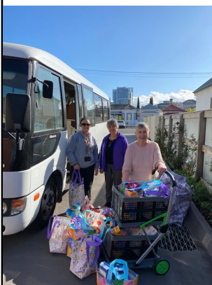
The Kilbreda bus full of goods!

Another, Melbourne based single mother of 2, set up her cottage industry to make masks for BASP, her daughters' school and others in the community. She has been dealing with serious health issues and she has found that this activity of being active and useful has given her a great lift.