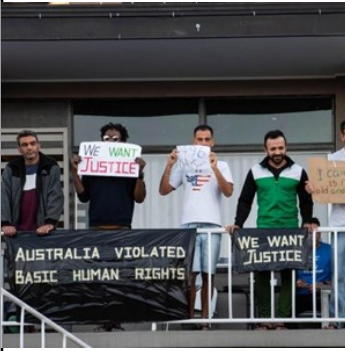
Men being held in Kangaroo Point Hotel in Brisbane.

We emailed those BASP supporters for whom we have email addresses the following message: