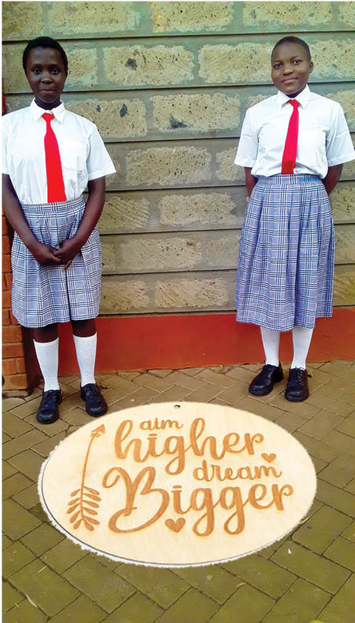
Back to school time and happy to have new uniforms!

children get to have a good meal and are putting more weight. It was awesome to see students in grade 4, as well as those in year 8 and year 12, get new uniforms as the old ones could not fit them. They recently went back to school when the government allowed the reopening of the schools.