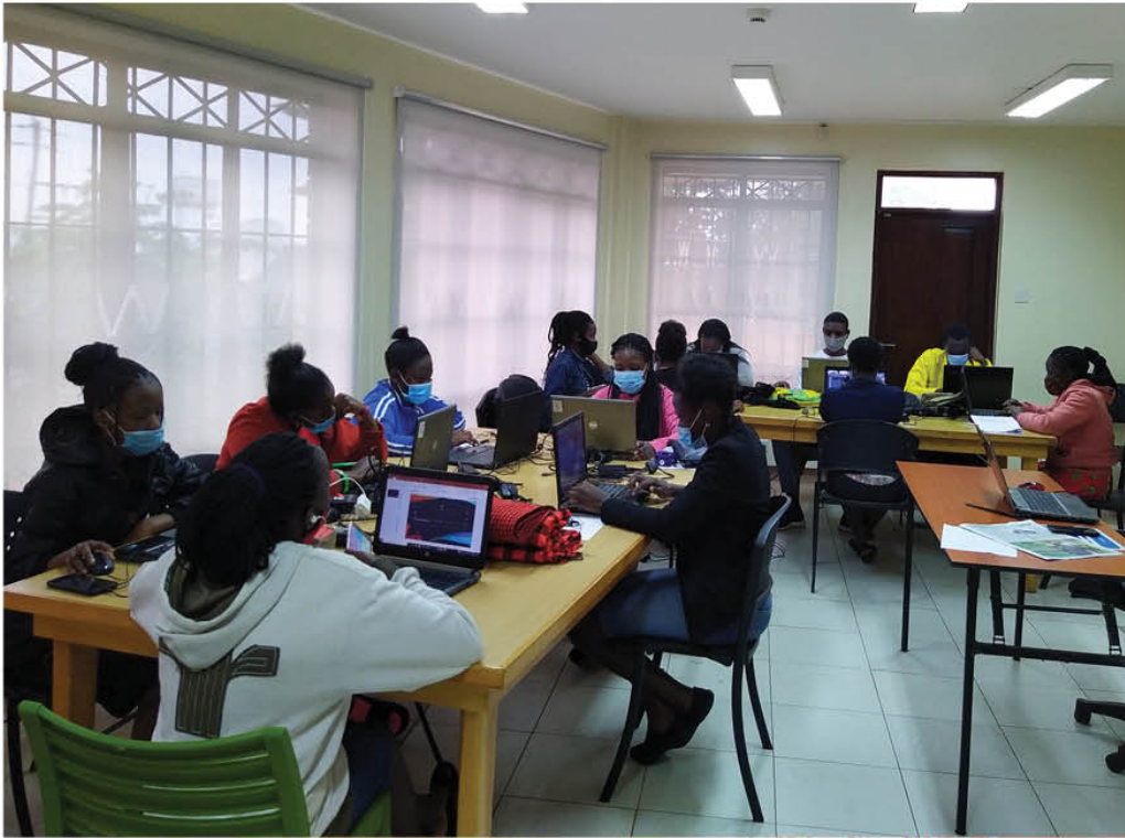
Ongoing ICT session

In the recent wake of the reopening of learning institutions, the WKW Centre reopened doors for the ICT students. Currently, they are working on their projects which include data handling, cybercafé, printshop and event management. They are happy to be back and have great stories to share.