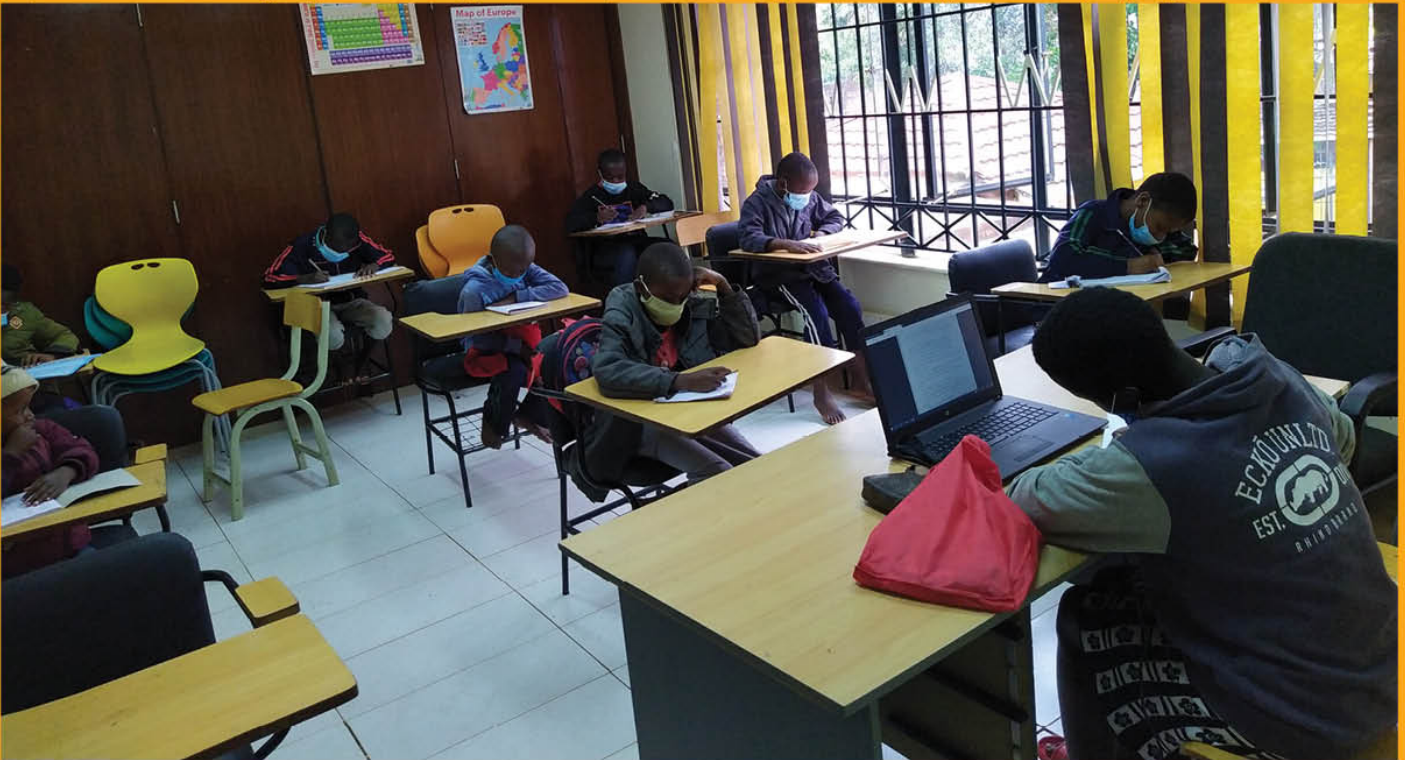
Primary students studying at the Centre

There is extreme uncertainty here in Kibera as the situation extends to be tougher with the 2nd wave of coronavirus hitting harder. Families continue being hit by the present harsh conditions. It has been hard to plan ahead, even for the government. However, we have experienced numerous blessings during this