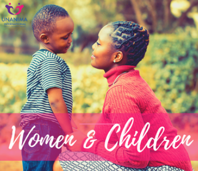
Women & Children