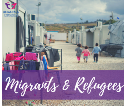
Migrants & Refugees