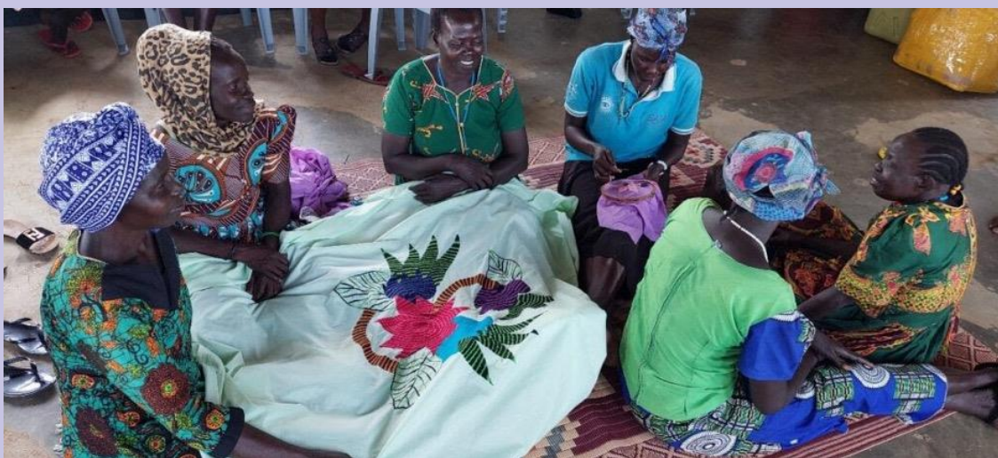
Making Bed Sheets