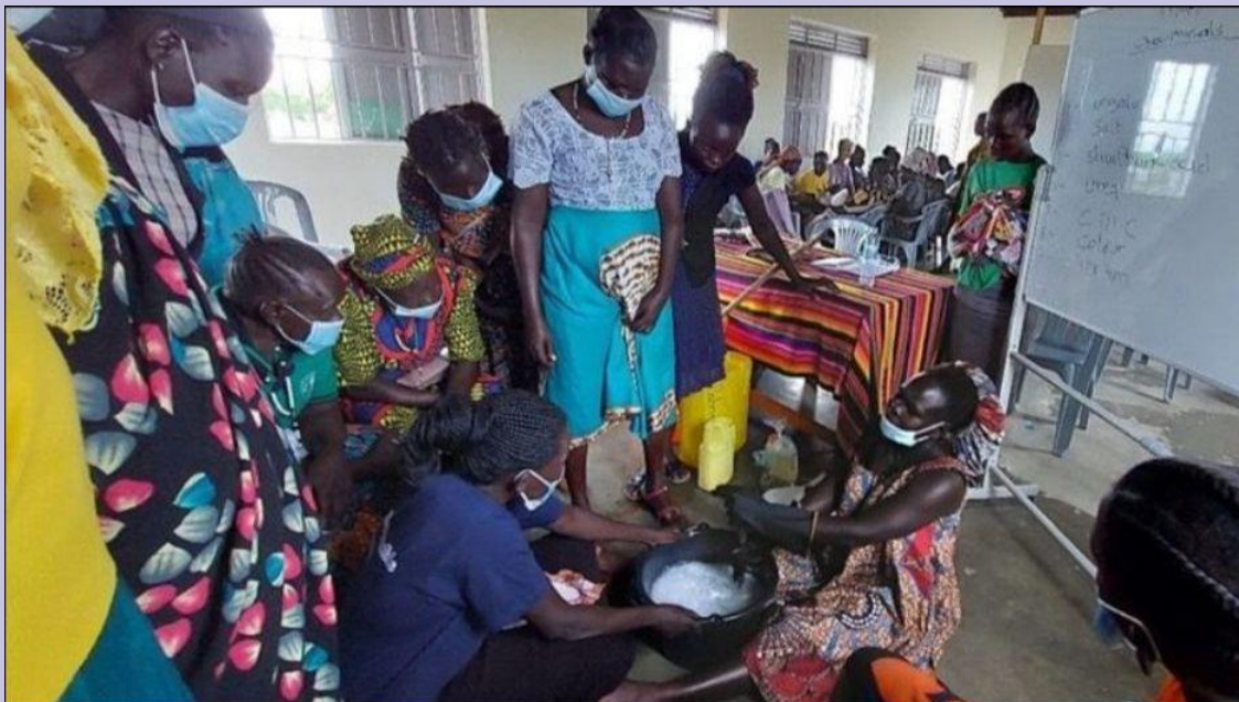
Representatives of the Groups training to make Liquid Soap