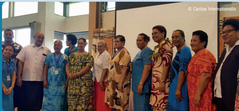
↑ Training programmes in Fiji. March 2021.

Volunteers attend a 3-day workshop where they are trained and also network with other volunteers and local NGO support staff from their region. The First Responders are supported by local churches and communities; for example, some parishes have provided designated spaces which First Responders can use to provide support services or as an office. This approach of supporting local volunteer-driven networks enables a far greater impact than could be otherwise achieved. The workshop had broad participation from representatives from interfaith denominations, including