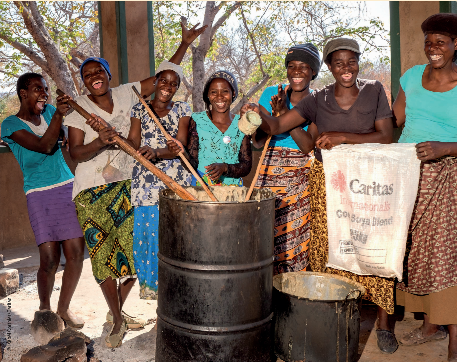
↓ Volunteers working to provide meals for schoolchildren during the Zimbabwe food crisis. 29 July 2016.

Undertaken in a spirit of unity, with love, respect and kindness at its centre, this process of renewal towards the promotion of women's leadership, equality and participation has the potential to be transformative for the Confederation.