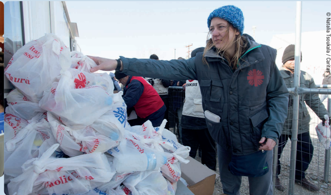
← Caritas providing food and WASH for refugees arriving in Greece.