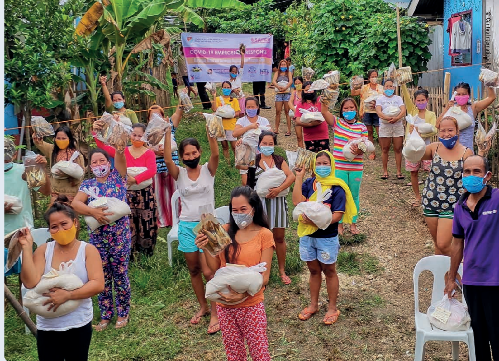
↑ Reaching out during COVID-19 in the Philippines. March 2021.

This leads to a reflection on the signs of our times and a suggested pathway to renewal for the Confederation, characterised by solidarity and community between and among all people.