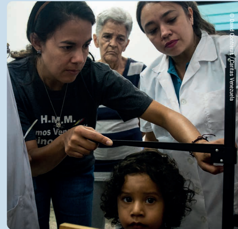
→ A Caritas nutrition monitoring centre in Venezuela 2018.

The sense of existential crisis which the pandemic brought about entailed unbearable pain for many people; but it is also possible to take comfort from the knowledge that such a crisis can also offer an opportunity for community growth.