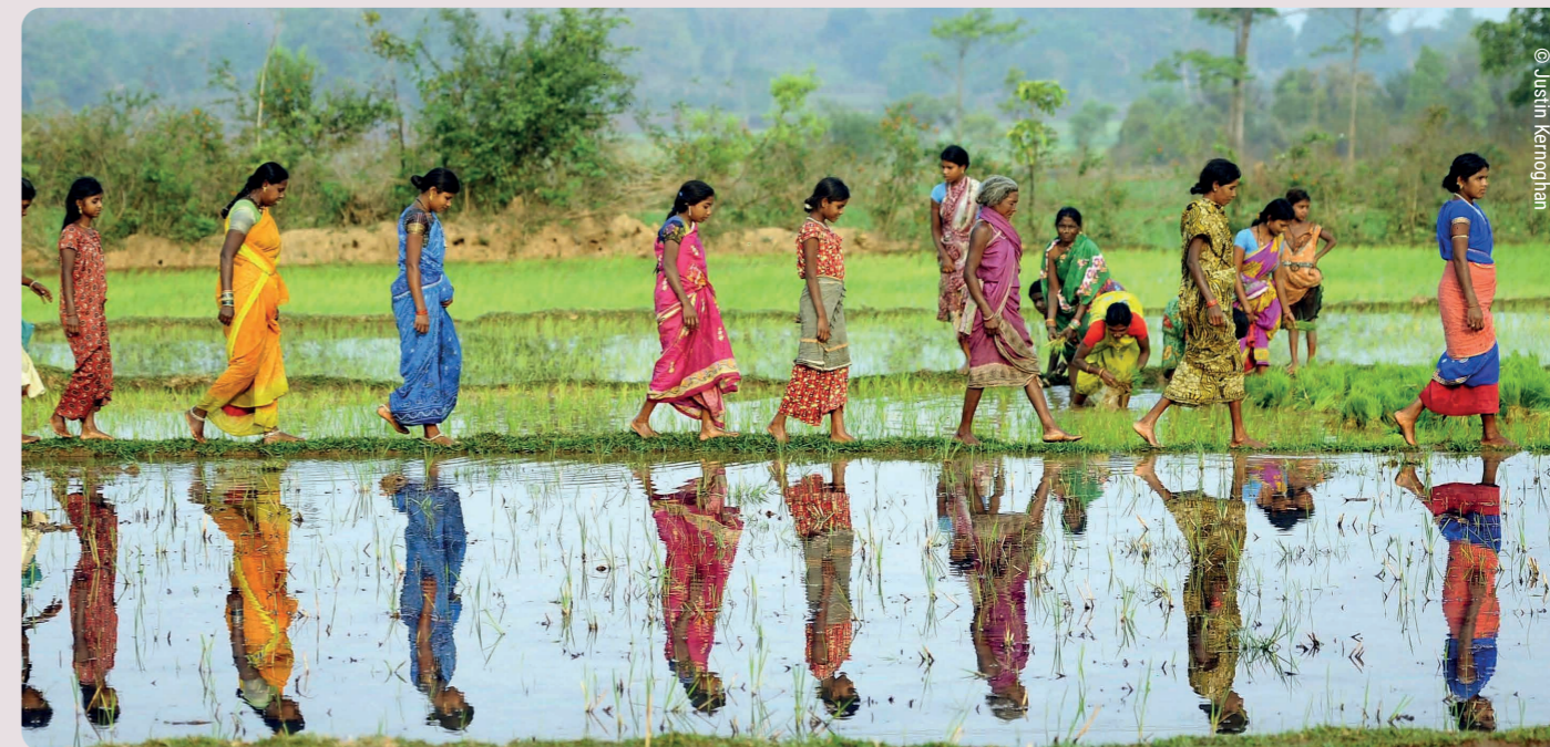
↓ Women working in their rice paddy fields in Orissa in India.