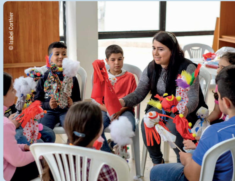
↑ Women leading trauma therapy for Syrian children in a community centre in Lebanon. 2016.

The change of society requires individual changes, of each of us, in our families, in our work, in our communities. We are all responsible for challenging our leaders and questioning our unjust structures.