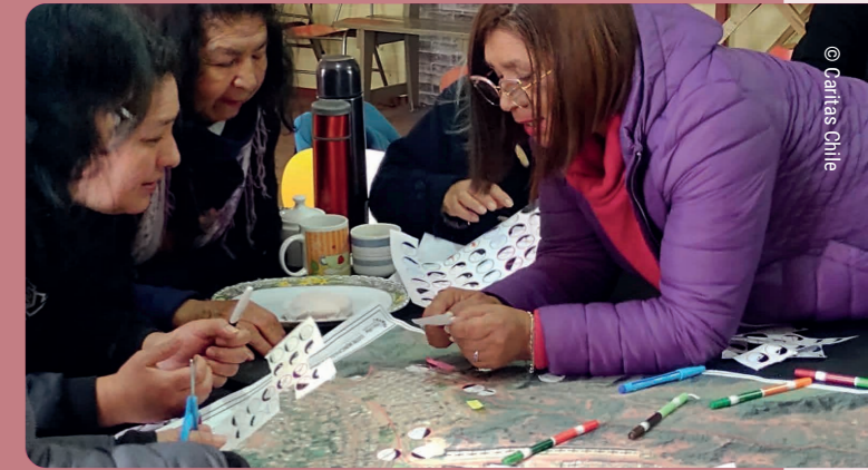
↑ Community Management for the reduction of forest fires, construction of risk map – Canal de Chacao Community, Quilpué, Chile.

Despite often facing discrimination within these spaces, women have contributed through their leadership in the construction of resilient communities, which has been highly valued by the authorities in the territories.