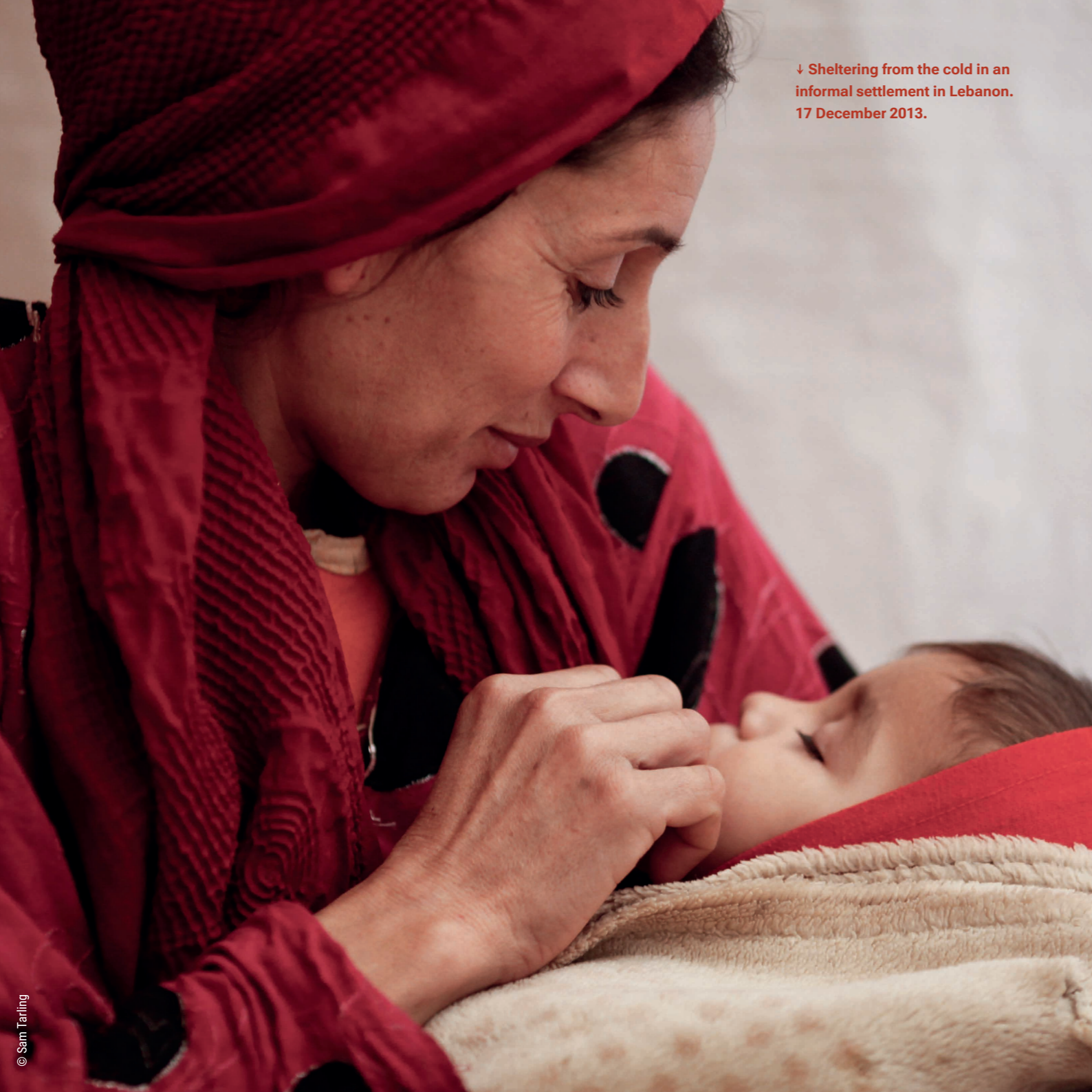
↓ Sheltering from the cold in an informal settlement in Lebanon. 17 December 2013.