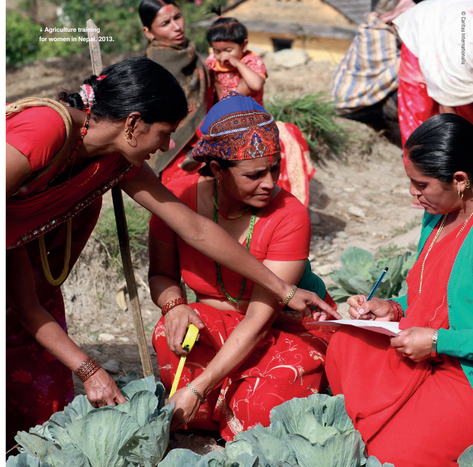
↓ Agriculture training for women in Nepal. 2013.

13 / https://international.la-croix.com/news/religion/leading-european-cardinal-says-church-must-change/15528