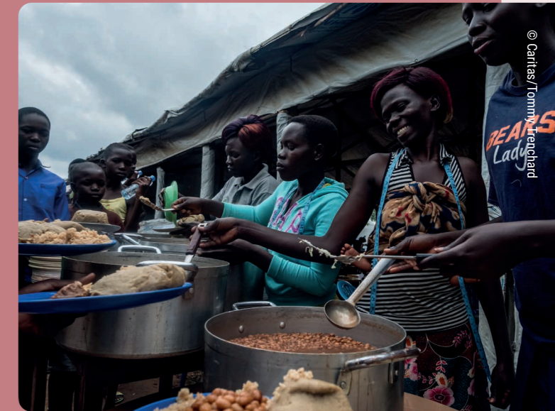
↑ Caritas volunteers serve a meal to refugees in Bidi bidi camp, Uganda, on International Refugee Day. 20 June 2018.

Inclusion and diversity make for more effective workplaces, because it allows for bringing in different perspectives and experiences into the reflections. We cannot afford to miss out on that. The promotion of women in leadership requires commitment, concrete action, buy in and support at all levels. Mentoring and peer support programmes are essential to support women in leadership positions.