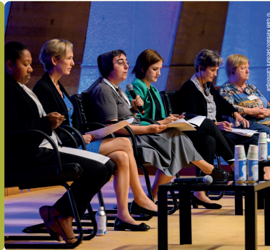
← Sr Smerilli speaking at The Full Face of Humanity: Women in leadership for a just society – Conference held at UNESCO, October 2022.