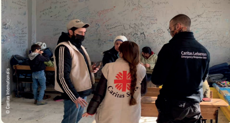
↑ Working together to respond to the earthquake in Syria. 1 March 2023.

Society always has the potential for such change, but for this change to be genuine, effective and sustainable it requires the active participation of all members of that society, through both heartfelt commitment and deliberate planning, collaboration, and action. In other words, in order to be successful, we must convert hearts and minds to the cause of concretely promoting equality between men and women.