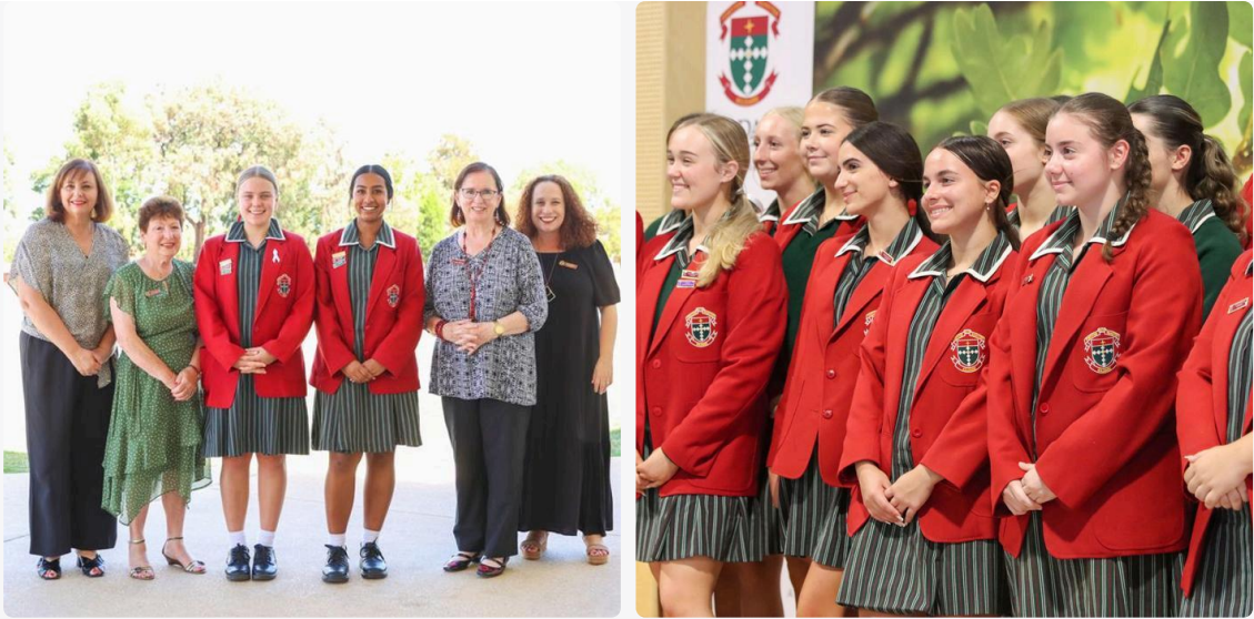
Killester College, Springvale