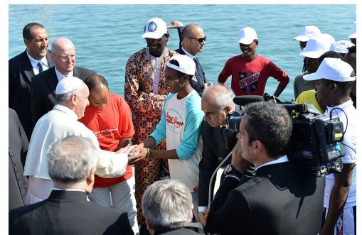
National Catholic Reporter July 6, 2023

We believe that a significant role for leadership is influencing for the common good. We need a moral voice of compassion. We need this to be echoed and reinforced in all parts of our society. We have elected a political party whose leader sees kindness and compassion as hallmarks of Australia to be cherished. May this extend to people seeking asylum, especially those with no reasonable hope for the future.